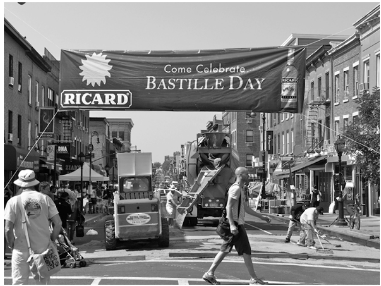
Preparation of courts for the Bar Tabac Bastille Day in South Brooklyn, July 18, 2010.

The ambience of the Bryant Park playing areas is pretty extraordinary. There are a lot of people, especially between midday and two o'clock. A more surprising discovery is the "Old" Bretons—les anciens, as they are called. Most of these Breton petanque players immigrated in the 1950s and '60s. Working mainly in the restaurant business, they still form a tight-knit community, with many living relatively close to the park. Some of these players came from Ariège and the vicinity of Nice. For all of them, petanque is an opportunity for sociability, getting them out to meet and spend time with their compatriots, which is very similar to the way petanque is played in France.